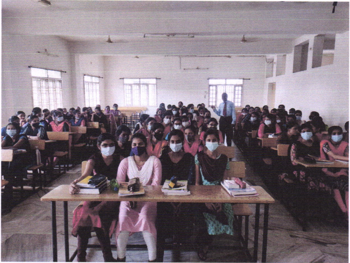
Figure 3: Students and Speaker in Leadership programme - 22-02-2021